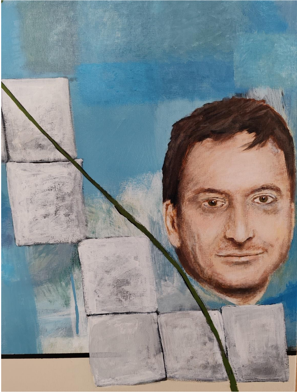
Untitled by Luke Burton