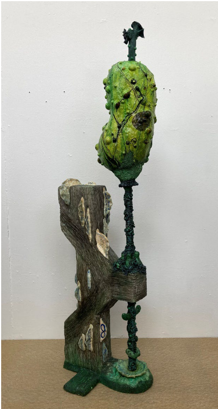
H±R-A, March 22, 1765-January 6, 2021 by Diana Puntar